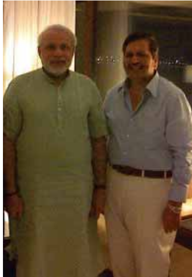
Inspiration from my role model - Shri Narendrabhai Modi