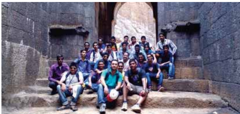
Students during personality building training

In today's corporate world, the importance of being able to communicate in English opens up tremendous opportunities. We conceptualized a programme to improve the English Speaking competency, which is helping over 500 individuals annually, especially young adults and housewives who did not get the opportunity to learn the language at school.