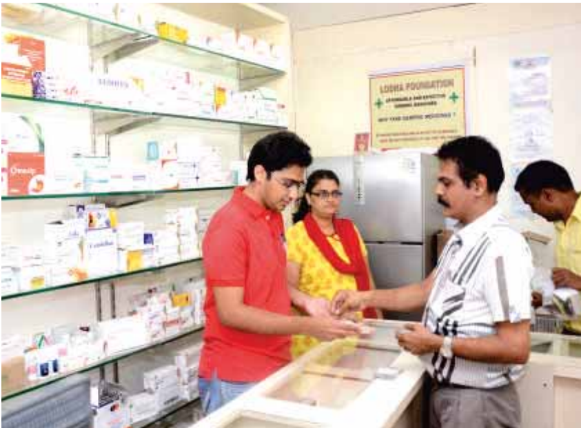
Pharmacy for low cost medicines

A generic medicine shop has been opened near Central Plaza, Girgaon to provide patients with over 270 types of good quality generic medicine at low cost. The pharmacy shop provides benefits to about 30,000 patients each year.