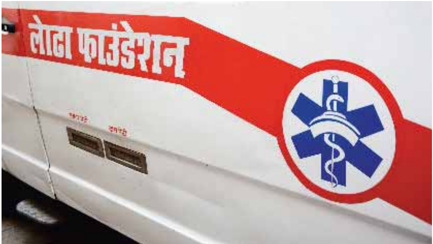
Lodha Foundation ambulance service