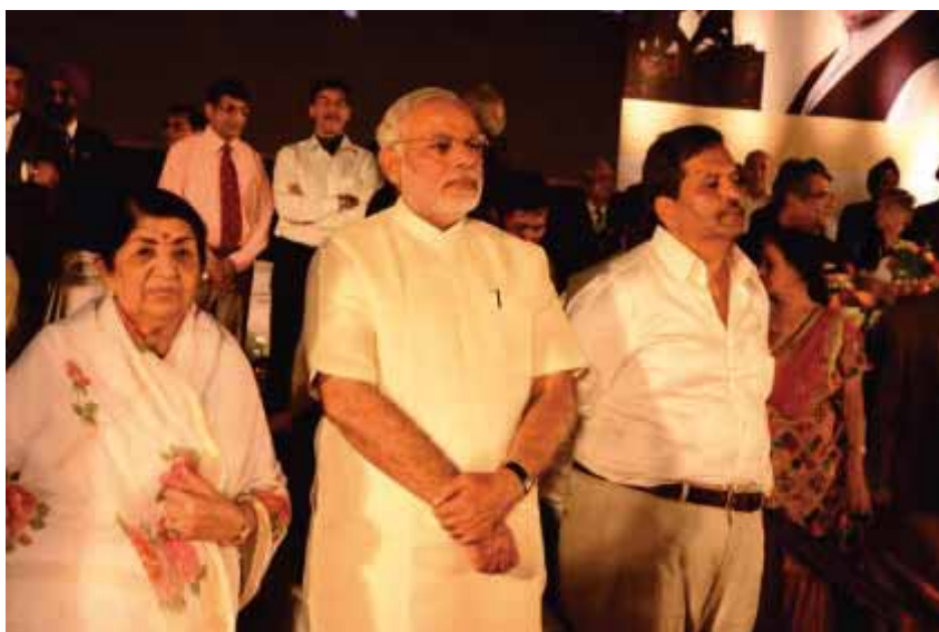
Paying tribute to our martyrs with Shri Narendrabhai Modi & Bharat Ratna Lata Mangeshkar